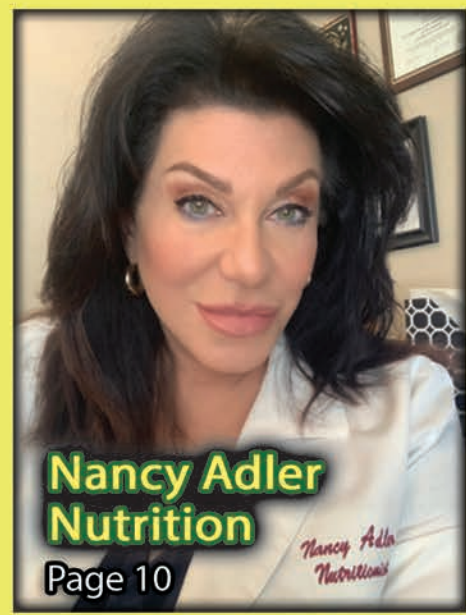
Nancy Adler Nutrition Page 10