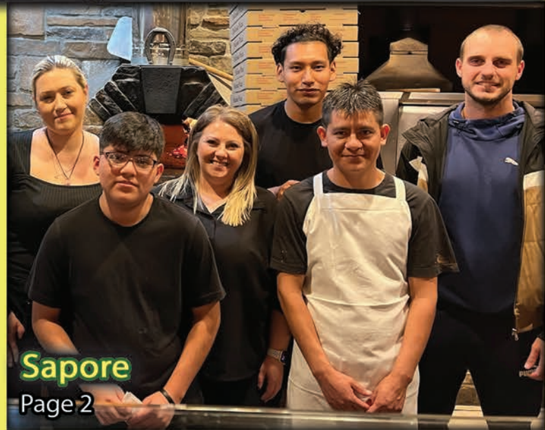
Sapore Page 2