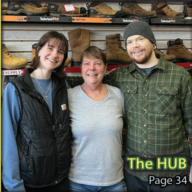
The HUB Page 34