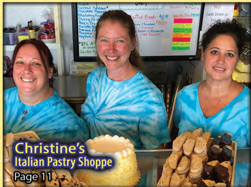
Christine's Italian Pastry Shoppe Page 11