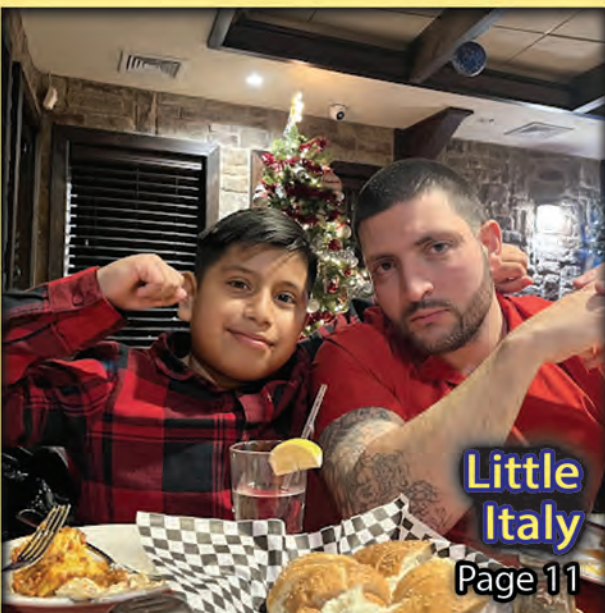
Little Italy Page 11