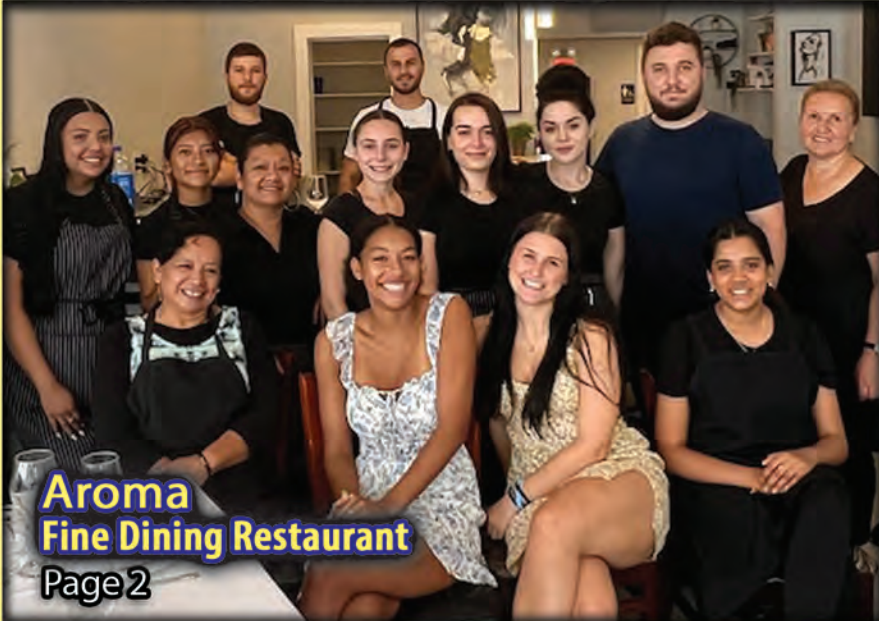
Aroma Fine Dining Restaurant Page 2