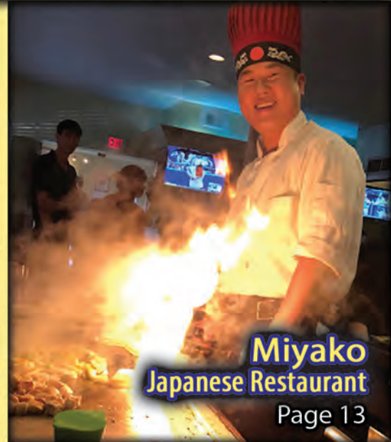
Miyako Japanese Restaurant Page 13